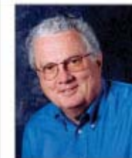
Pete Griffin Realtor®, E-pro

This comprehensive map includes detailed information intended to make your hiking or riding experience much more enjoyable. By taking a moment to familiarize yourself with the details in this map, you will be able to plan and customize your trail excursion with greater accuracy. Our goal in developing this map was to ensure that all trail users, from beginning riders to experienced and conditioned trail runners, can enjoy the Tahoe Donner trail system to the fullest. Please remember to carry and drink plenty of water, use sunscreen, and respect the trails.