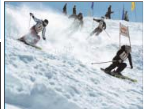
Skiers race down the course in this year's Silverbelt Race.